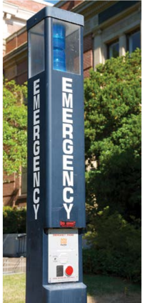
▲ Blue Light Emergency Phone

The Public Safety Department is on campus to help keep students safe . PHONE (24 Hours, 7 days a week): 541-322-3110